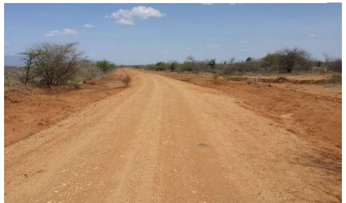
Term Maintenance of Kotido-Kapelimoru-Lopei and Ariamoi-Lopei Roads