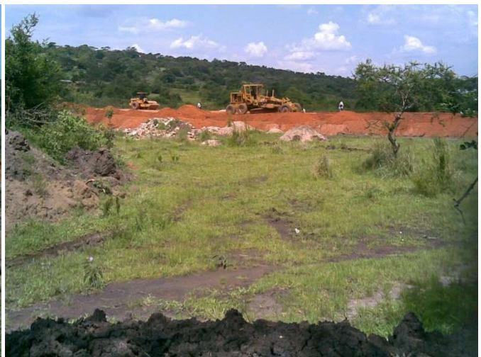
Construction of Mayikalo Dam in Sembabule District