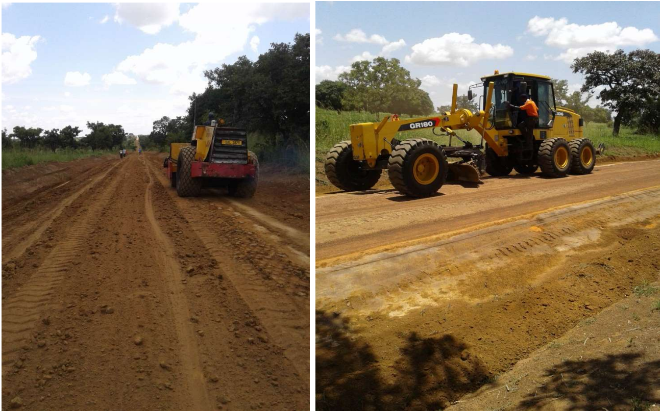
Periodic Maintenance of Kitgum-Kalongo- Patongo and Patongo-Lukee Roads