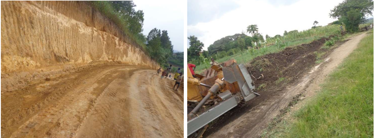
Construction of 18.3km of Community Access Road in Kicuzi Sub-County, Ibanda