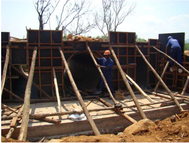
Construction of Kabuhuna Swamp Crossing